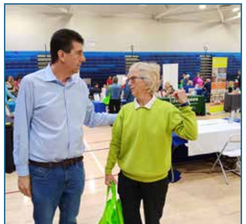
We had more than 200 seniors attend our Senior Fair, where they were able to pick up useful info on everything from their health to finances to personal safety.