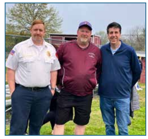
It was another great opening day for the Pottsgrove-Pottstown Little League, and I was honored to be asked to sing the National Anthem.